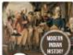
governor general of India.pdf