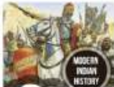
Conquest of Sindh.pdf