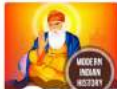
Conquest of Punjab.pdf