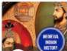
Mughal & Tughlaq.pdf