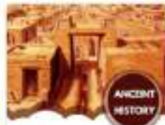
IVC IMPORTANT SITE..