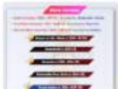
Purgals Watercolor List..