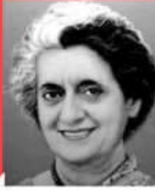
INDIRA GANDHI 24 JAN 1966 - 24 MARCH 1977