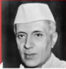
JAWAHAR LAL NEHRU 15 AUG 1947 - 27 MAY 1964