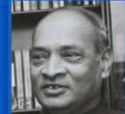
P. V. NARASIMHA RAO 21 JUNE 1991 - 16 MAY 1996