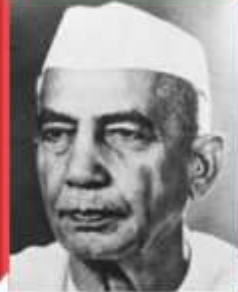
CHARAN SINGH 28 JULY 1979 - 14 JAN 1980