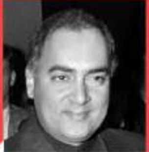
RAJIV GANDHI 31 OCT 1984 - 2 DEC 1989