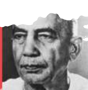
CHARAN SINGH 28 JULY 1979 - 14 JAN 1980