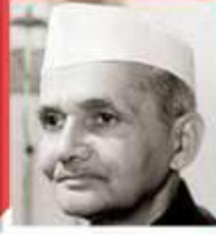
LAL BAHADUR SHASTRI 9 JUNE 1964 - 11 JAN 1966