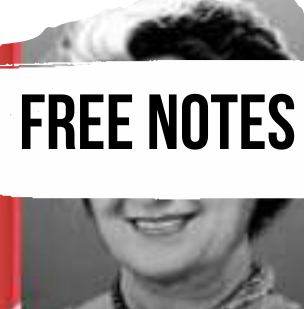
INDIRA GANDHI 14 JAN 1980 - 31 OCTOBER 1984