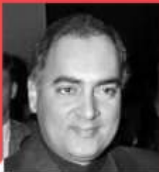
RAJIV GANDHI 31 OCT 1984 - 2 DEC 1989