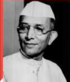
MORARJI DESAI 24 MARCH 1977 - 28 JULY 1979