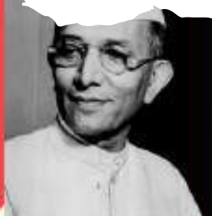
MORARJI DESAI 24 MARCH 1977 - 28 JULY 1979