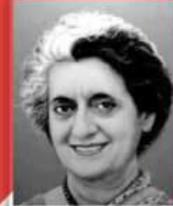
INDIRA GANDHI 14 JAN 1980 - 31 OCTOBER 1984