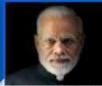
NARENDRA MODI 26 MAY 2014 - PRESENT