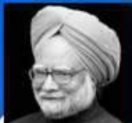
MANMOHAN SINGH 22 MAY 2004 TO 26 MAY 2014