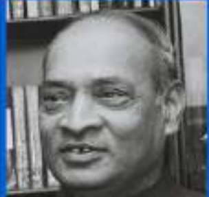
P. V. NARASIMHA RAO 21 JUNE 1991 - 16 MAY 1996