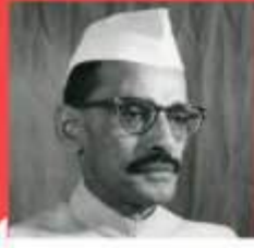
GULZARILAL NANDA 27 MAY 1964 - 9 JUNE 1964