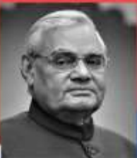
ATAL BIHARI VAJPAYEE 16 MAY 1996 - 1 JUNE 1996