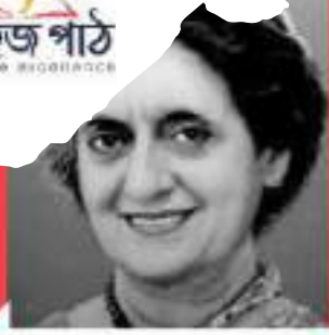
INDIRA GANDHI 24 JAN 1966 - 24 MARCH 1977